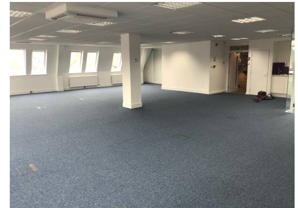
An example of another suite that was available on the 2 nd floor.

The building has an EPC rating of C – 68. The EPC certificate is available upon request.